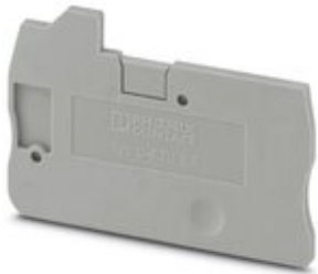
End cover, length: 53.5 mm, width: 2.2 mm, height: 35.1 mm, color: gray

Please be informed that the data shown in this PDF Document is generated from our Online Catalog. Please find the complete data in the user's documentation. Our General Terms of Use for Downloads are valid ( http://phoenixcontact.com/download )